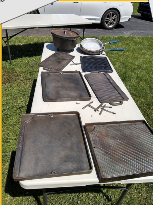
P116 leaders cleaned out their entire storage!

Fishers Troop 205 could have been like a number of units around the country and let the current crisis negatively impact their participation in scouting activities. You can't really do much as scouts when you cannot get together....right? Wrong!!!