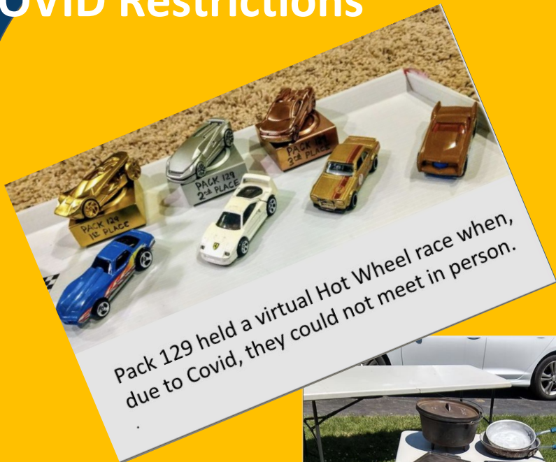
Pack 129 held a virtual Hot Wheel race when, due to Covid, they could not meet in person.