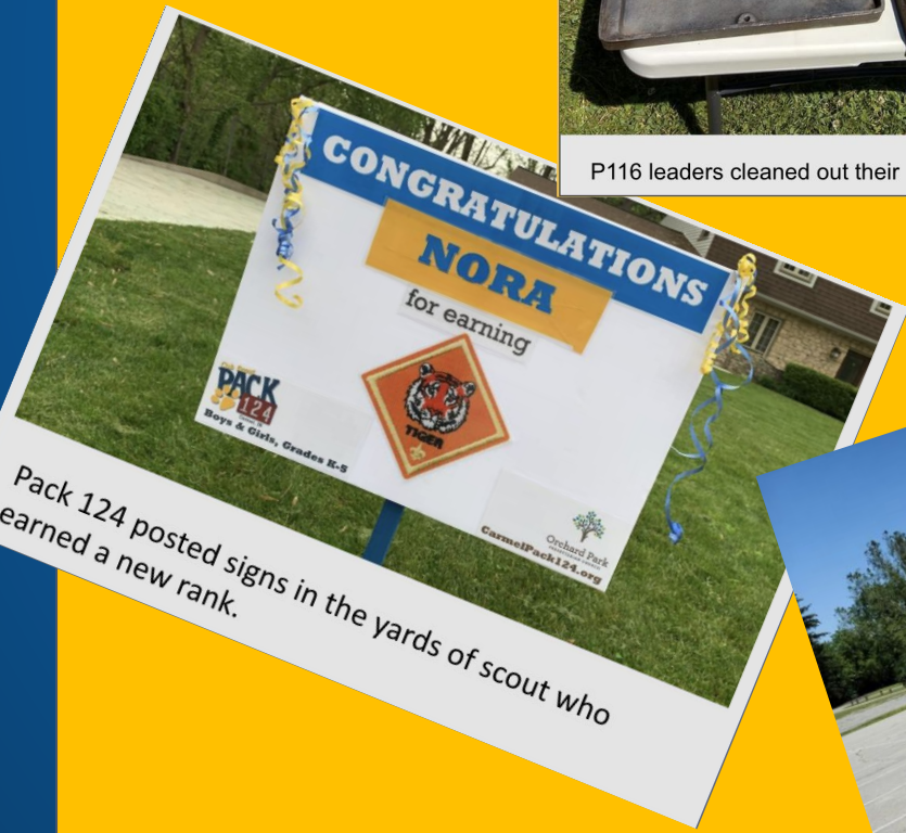
Pack 124 posted signs in the yards of scout who earned a new rank.

About Troop 205: Troop 205 is located in Fishers, Indiana, and is chartered by Christ's Community Church located at 13097 Allisonville Road.