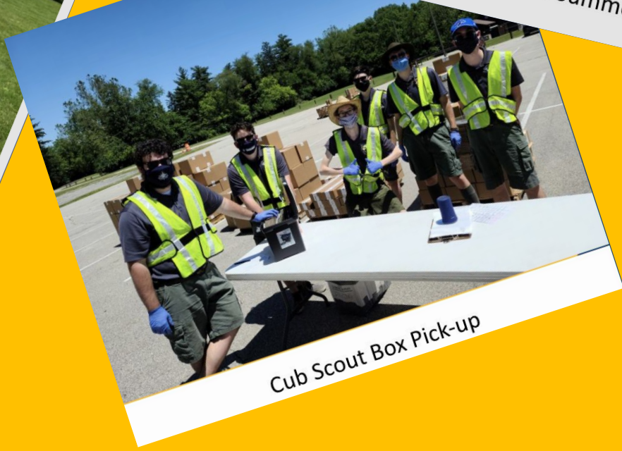
Cub Scout Box Pick-up