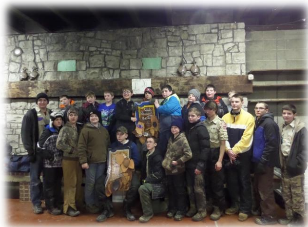
Pack & Troop 359