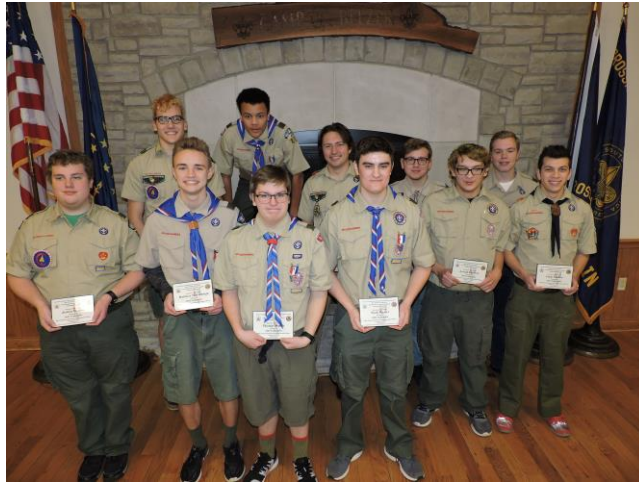
Northeast District Eagle Scouts

Additionally, volunteers at the unit level were recognized with Golden Spike Awards. This award, given annually, recognizes registered Scouters who continually provide initiative, enthusiasm, and exceptional service to the Scouting programs in which they serve. These Scouters hold their respective programs together. They provide the spark to deliver on the promise of quality Scouting to packs, troops, crews, teams.