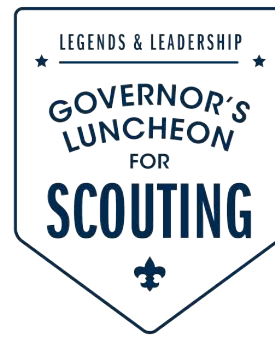
TABLE HOST Position Description