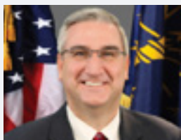
Eric Holcomb Governor of Indiana